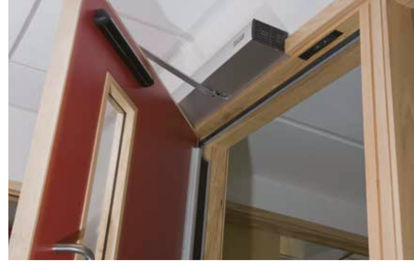
Motion sensor controlled power operated door

It is also stated that it is preferable that backchecks should not operate before about 80° open and that the maximum closing force should occur between 0° and 15^\circ of final closing.